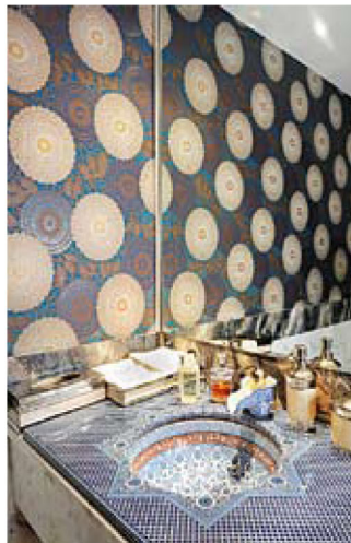
The powder room designed in blue tones reminiscent of the blue-tile work of Persia.

While high ceiling-to-floor sheer curtains with black drapes pulled to the side, large glass panels and low-back white sofas create a sense of space and openness, a design palette of black and white, with a touch of matt gold and wood infuses it with warmth. Small details like the