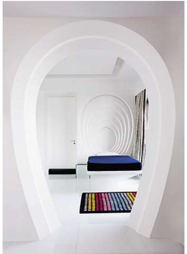
The horse-shoe entrance of the spacious children's room