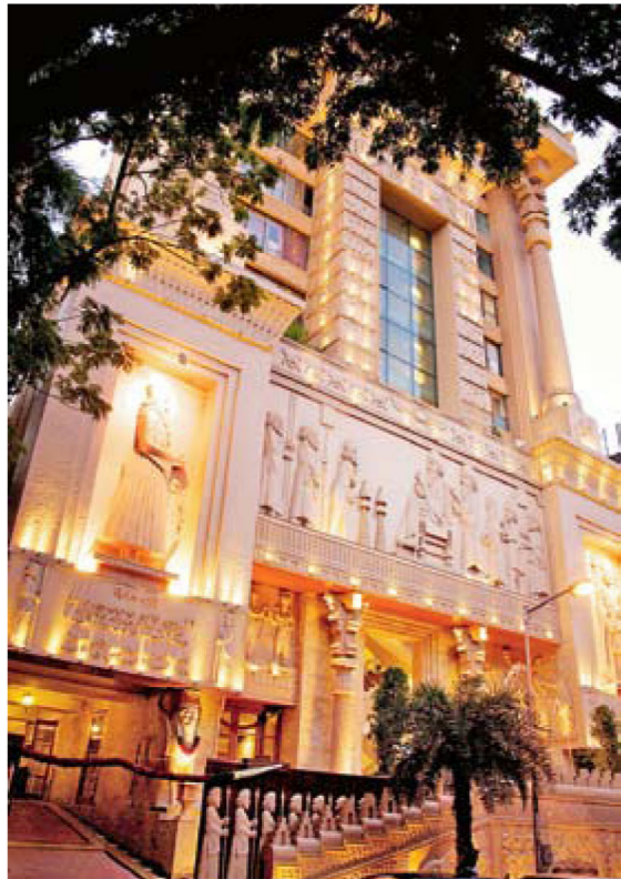
The façade of Della Tower, a 21-storey residential tower, at Parsi Colony, Dadar, Mumbai, offers a glimpse of the grandeur of Persepolis, the ceremonial capital of the ancient Achaemenid Empire in Iran, whose rulers practised the Zoroastrian faith, and whose descendants, the Parsis and Iranis settled in India.