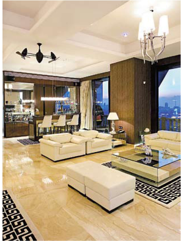
The family living room echoes the design palette of the formal living room in its colours and elements. A fan with chopper blades adds interest to the space.

depictions such as the struggle between a bull and a lion that has multiple interpretations including signifying the cycle of life and of seasons.