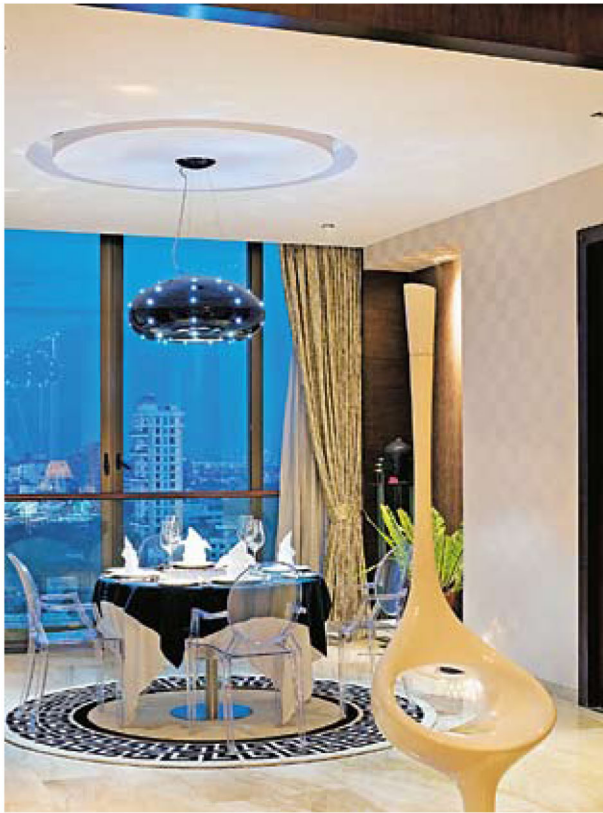
The breakfast table for the family with chairs designed by French designer Philippe Starck for Kartell and a Fabbian lamp overhead.