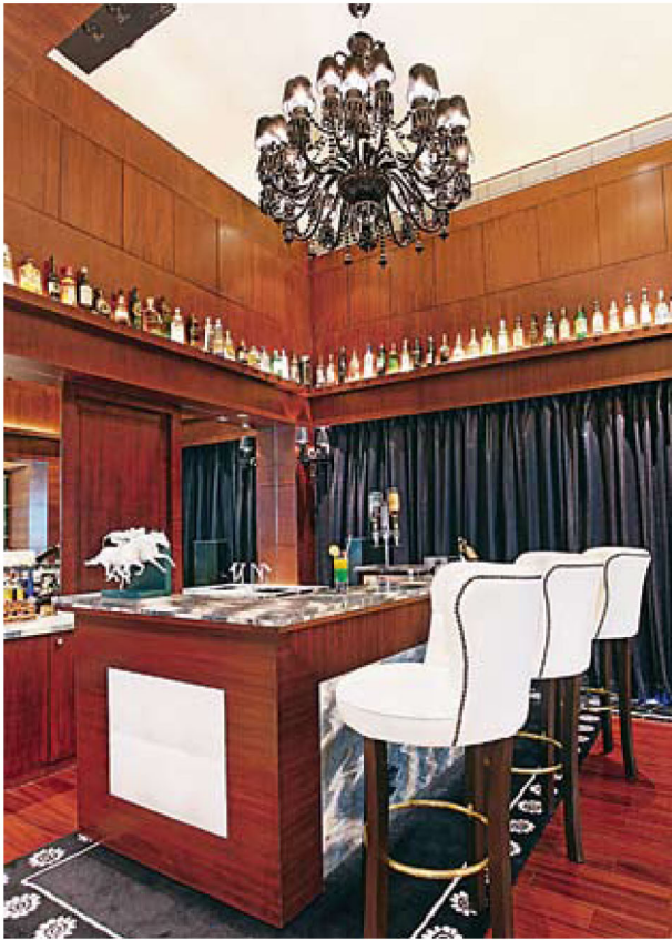
The bar with a display of Jimmy's collection of malts and vodkas