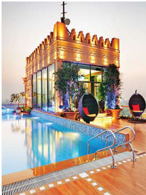
The open-to-sky pool on the top floor with a covered lounge area that blends traditional and modern elements in its design.

The twenty-four seater dining table is always immaculately set with a customised white linen tablecloth, fine crockery and cutlery.