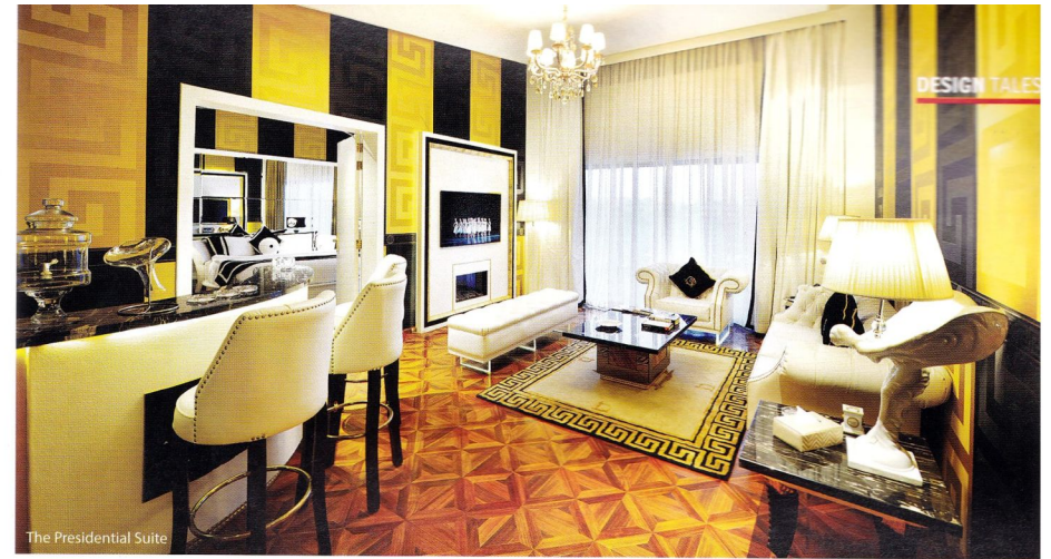
The Presidential Suite

“At Della we create very unconventional, research oriented and inspirational designs, which are extremely process oriented and also it aims at improving the lives of people and the environment they occupy”