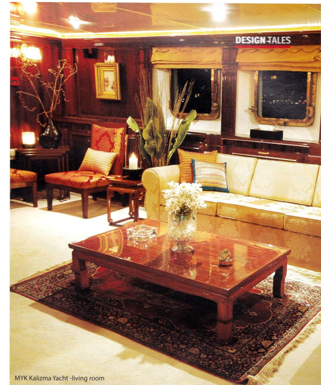
MYK Kalizma Yacht -living room

The journey began in 2007 when I identified a piece of land to create a home for myself in Lonavala and from there on I fell in love with the property and I decided to build a few villas. That's where the real journey of Della Adventure & Resorts started. We expanded into Della adventure which was more of passion that turned into