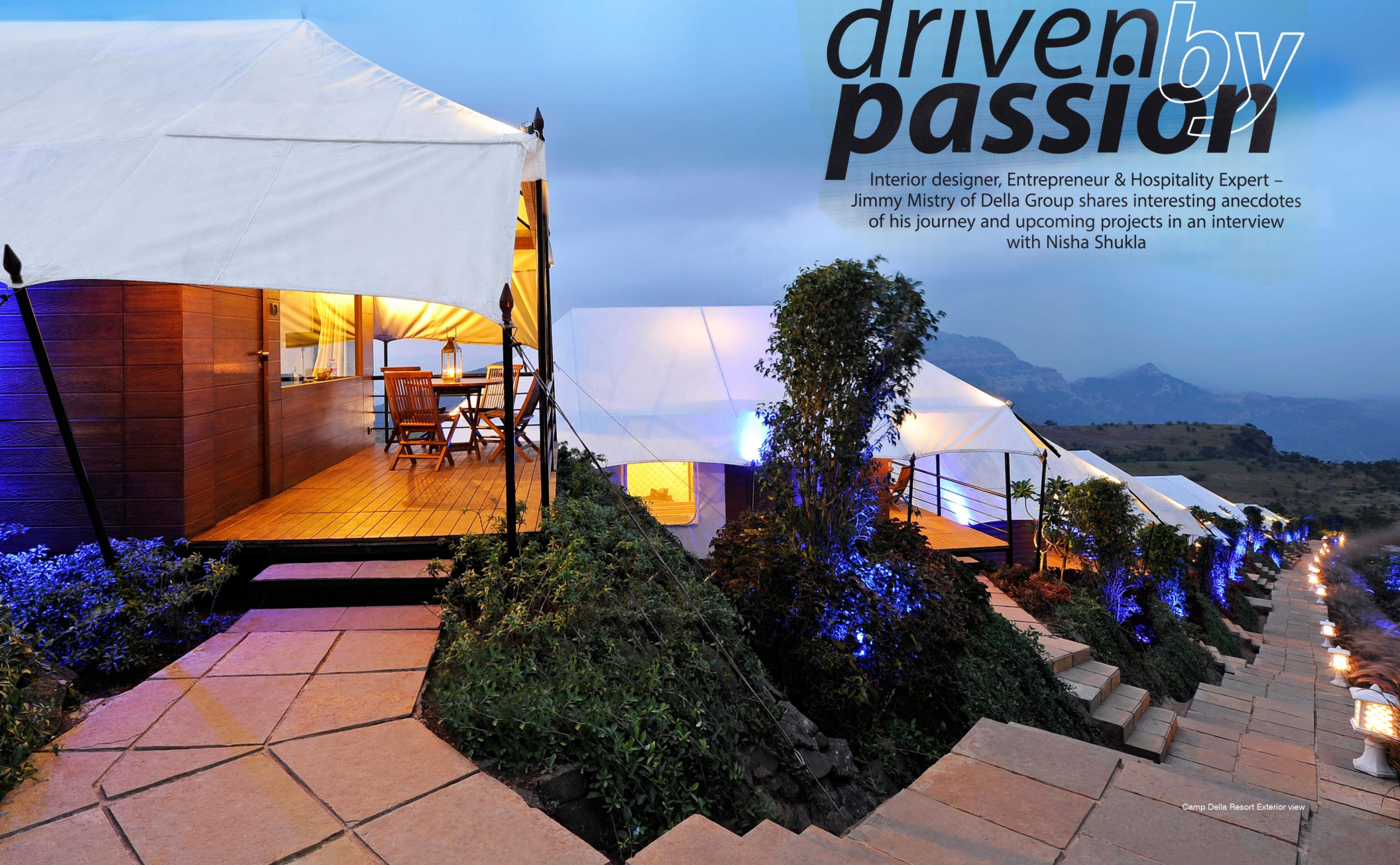
Camp Della Resort Exterior view