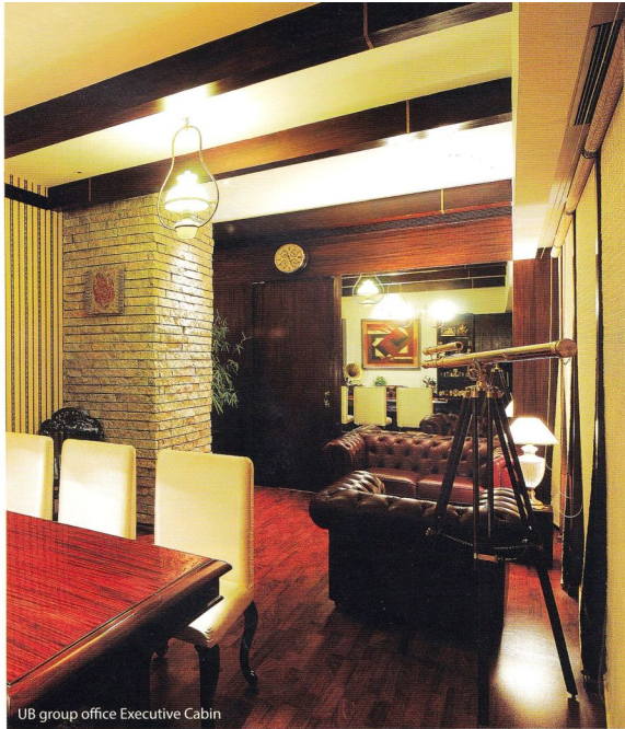
UB group office Executive Cabin

Architecture in India has woken up to a rude shock because of the global onslaught of international architects and design firms who have come in rampant into our country in about the last 10 years. Most of our Indian design firms with large practices have