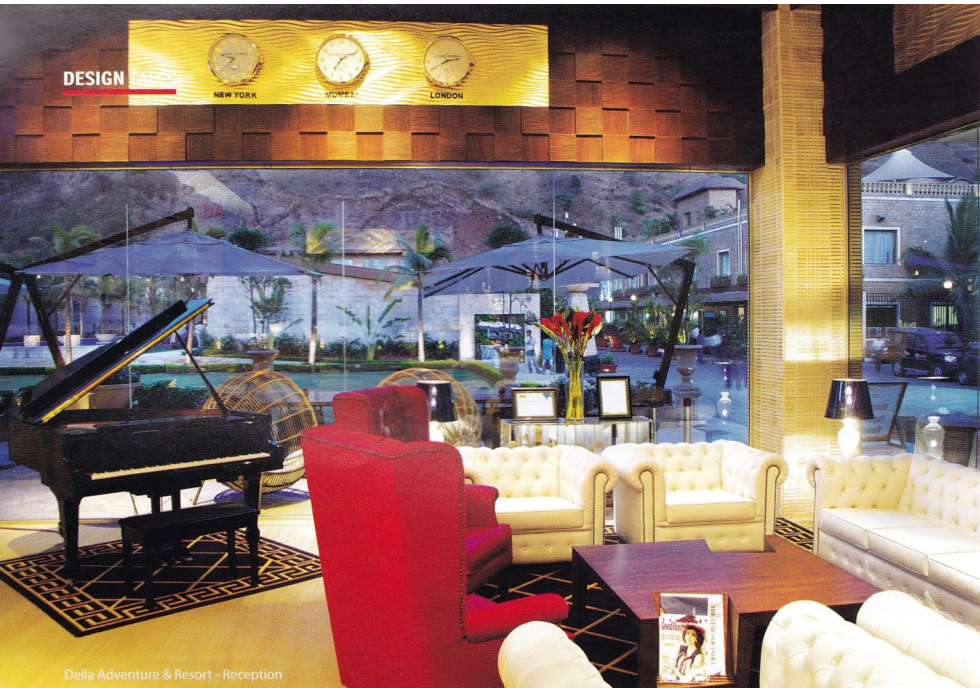
Della Adventure &amp; Resort - Reception