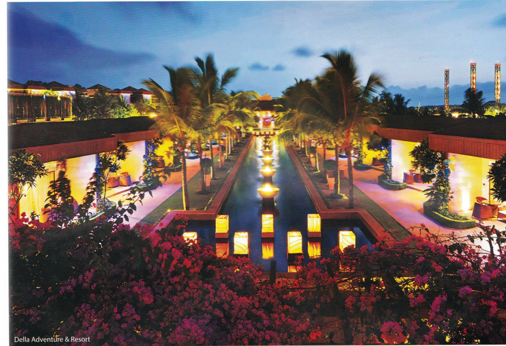
Della Adventure & Resort