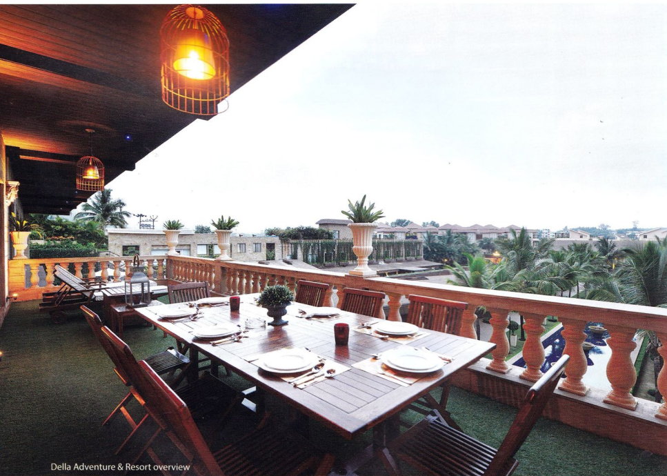
Della Adventure & Resort overview