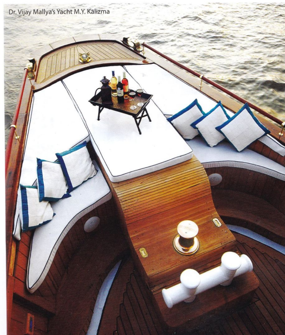
Dr. Vijay Mallya's Yacht M.Y. Kalizma

turned into drafting studios for these international firms. Hence, when you look at large scale developments especially upmarket development in the cities, developers are choosing only to use international design firms and not domestic. And yet it's a very interesting time as the magnitude of development is very high in terms of high-rises and mix-use projects. Hence, I think it's become important for architects and design firms to get their acts together, scale up their operations and design processes and try and go out there to create something unique that would give our architectural landscape a flavour of its own, even with the onslaught of these highly professional international firms.