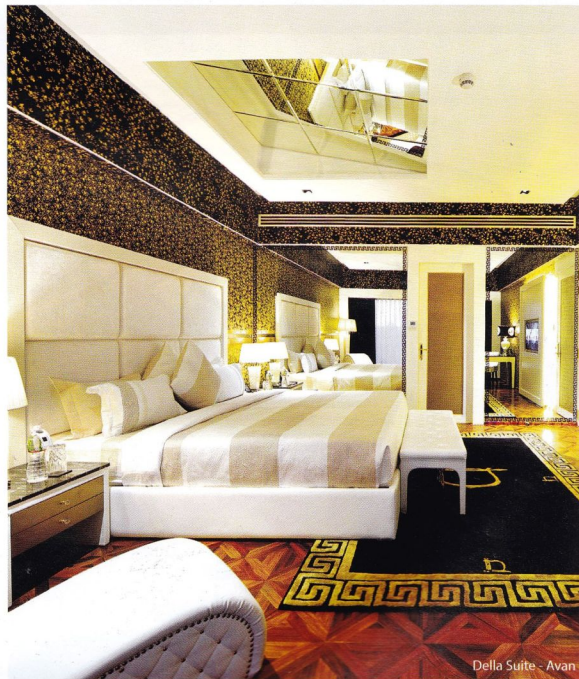
Della Suite - Avan

DATA (Della Adventure and Training Academy) being the latest addition, has generated a great response especially to the idea of military style training with luxury amenities available for civilians. Modules span across Counter-terrorism for Civilians, Real-life Survival and Jungle Survival, each of which features different progressive levels to be achieved. I believe there will be opportunities coming up very shortly to expand into other cities as well.