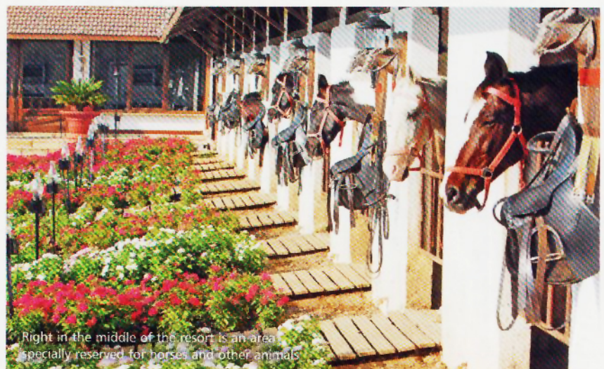
Right in the middle of the resort is an area specially reserved for horses and other animals

Like Jimmy says, it is not just a disconnect with animals that city