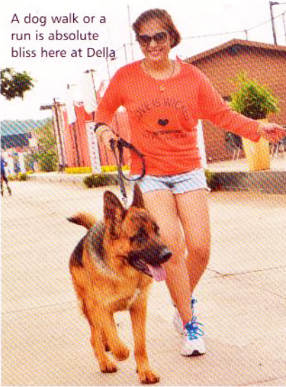
A dog walk or a run is absolute bliss here at Della