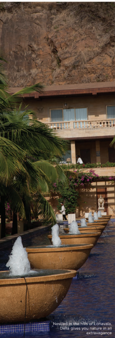
Nestled in the hills of Lonavala, Della gives you nature in all extravagance