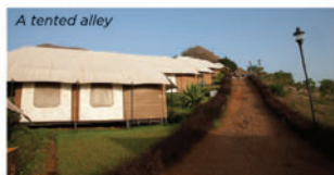
A tented alley