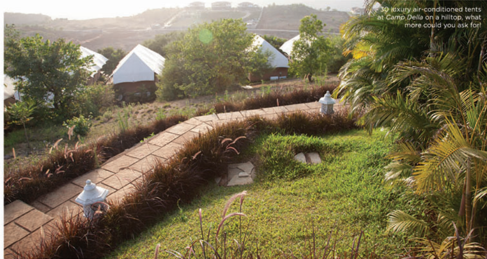
30 luxury air-conditioned tents at Camp Della on a hilltop, what more could you ask for!

There on the slopes with mud alleys, sit, flapping in the cool breeze and happy sunshine, 30 luxury tents, air-conditioned and very inviting. With 140 sq. ft. of bathroom space it can't get better. I belong