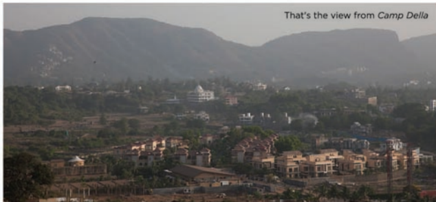
That's the view from Camp Della