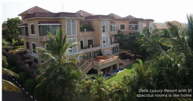
Della Luxury Resort with 51 spacious rooms is like home

To top it all, they have banquet rooms in varying sizes and various locations where you could have any kind of function you desired; weddings, pre-weddings, birthdays, anniversaries... plus corporate events with state-of-the-art facilities. So the