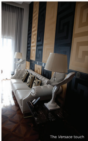
The Versace touch