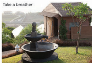
Take a breather