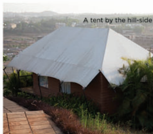
A tent by the hill-side